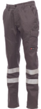
Smoke / Smoke