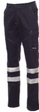
Blu navy / Navy blue